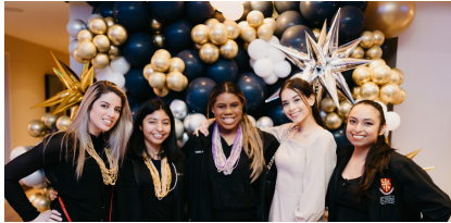
Nursing Student Volunteers

It would be impossible to host this event without the assistance of these exceptional committee members!