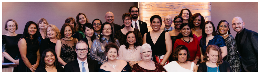
Honorees & Scholarship Recipients